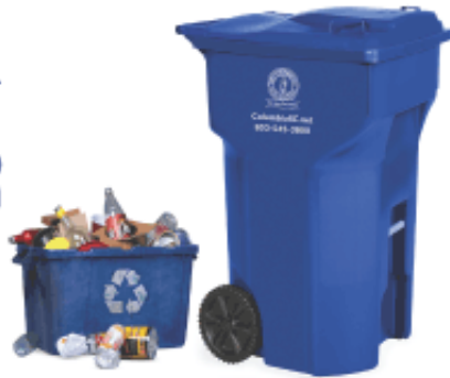
MEET YOUR NEW 2015 RECYCLING CART.